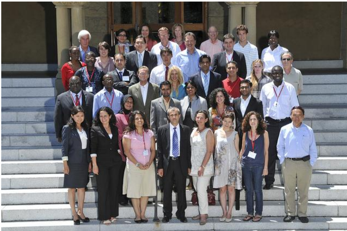
2011 Class of Draper Hills Summer Fellows

(Online Applicant Portal opens October 3, 2011)