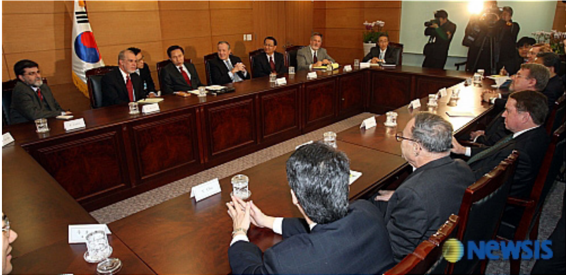
New Beginnings group members meet with then President-elect Lee Myung-Bak, February 5, 2008.