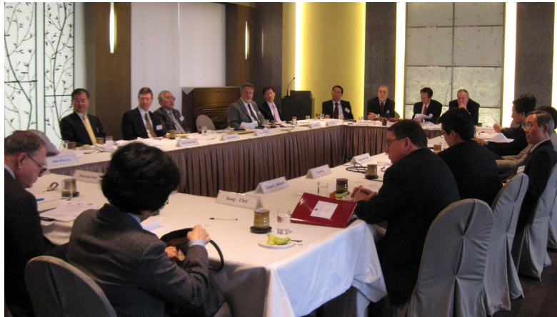
Meeting with Korean alliance experts, February 4, 2008

actions speak louder than words, words do matter. Such a joint statement should identify areas for expanded cooperation and mobilize officials of both governments to meet the two presidents' goals. On both sides, political will is vital to ensure the implementation of such a partnership. If the vision represented by a joint statement is to be sustainable, it should represent a consensus of what is desirable and