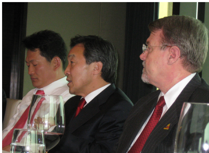
Meeting with opposition leader Sohn Hak-kyu, February 5, 2008

Soon after Roh's election, however, Korean popular attitudes about foreign policy, and especially about the United States, began to change. President Roh's declining popularity was accompanied by growing skepticism about North Korea's receptiveness to reform. The Bush