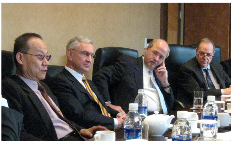
Meeting with the American Chamber of Commerce in Seoul, February 4, 2008